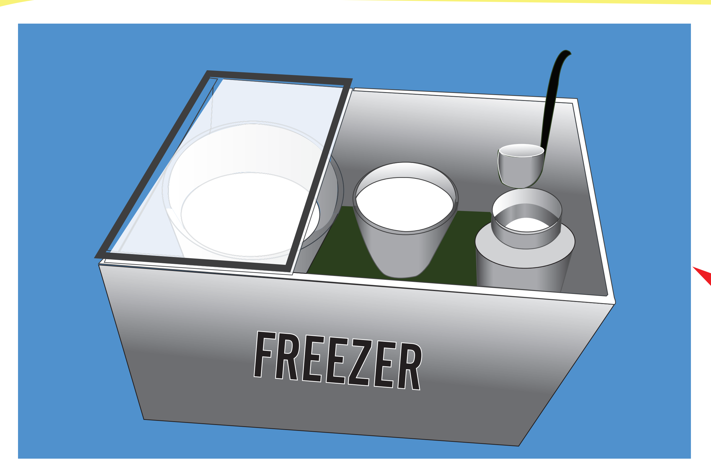
Store and sell milk in a clean freezer